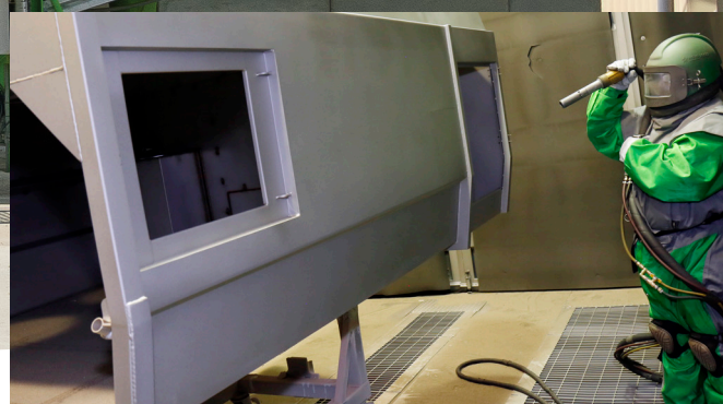
Shot blasting the hopper's stainless steel body

The hopper is manufactured from strong, corrosion and abrasion-resistant 4003 Stainless Steel which is then shot blasted before a two-pack epoxy primer is applied, followed by a hard-wearing topcoat.